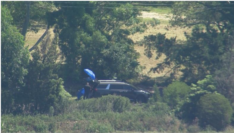
Officers were searching for a missing man when they found suspected human remains under a tarp near a home in Glenorie.