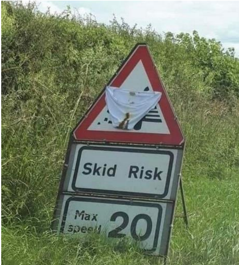
The Car Bible