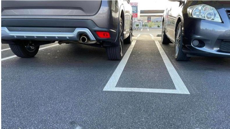
A shopping centre is being praised for its unusual car park spaces. Photos of the car park in Tasmania shows the white lines painted on the ground.

31 January, from 9 News Sydney: ALERT: Australia's consumer watchdog has issued a warning after an imported male enhancement supplement was found to contain an undeclared ingredient.