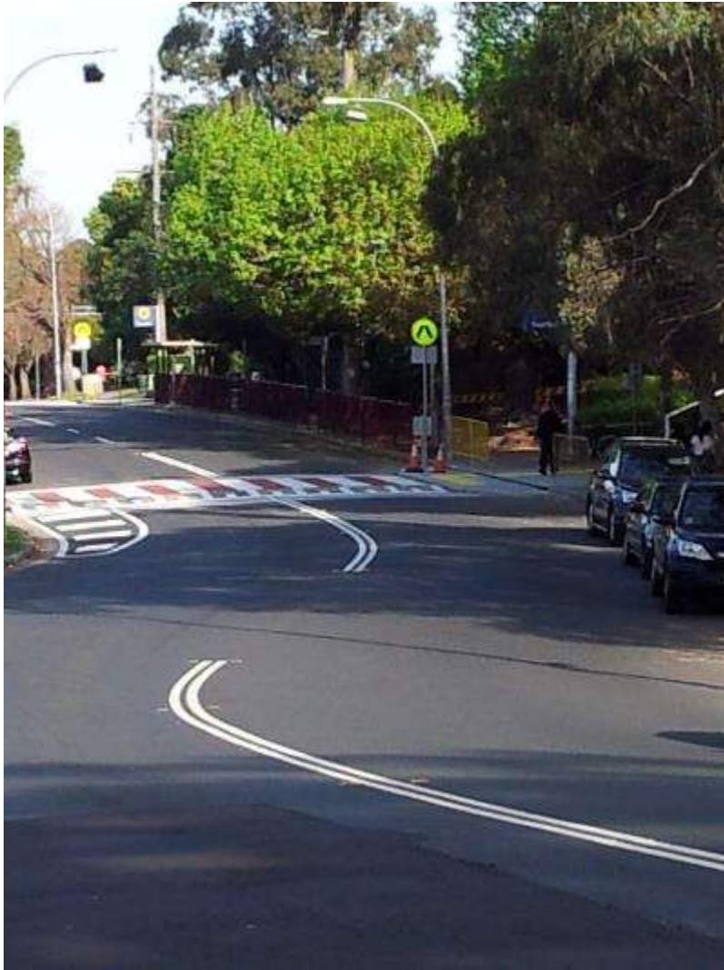
Upgrade of the pedestrian crossing near the intersection of Werona Avenue and Khartoum Avenue.