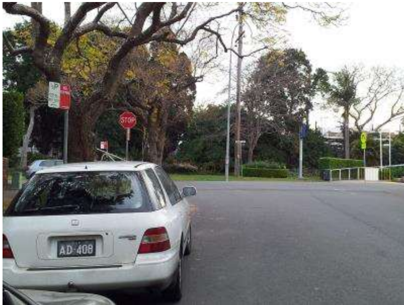
New 'STOP' sign at the Robert Street/Werona Avenue intersection.

Did you know? The term "spear phishing"? The government website: http://www.staysmartonline.gov.au/quizzes/phishing_quiz/phishing_quiz.html , has an Online Phishing Quiz that tests your understanding of this and other aspects of "Phishing". Why not give it a go?