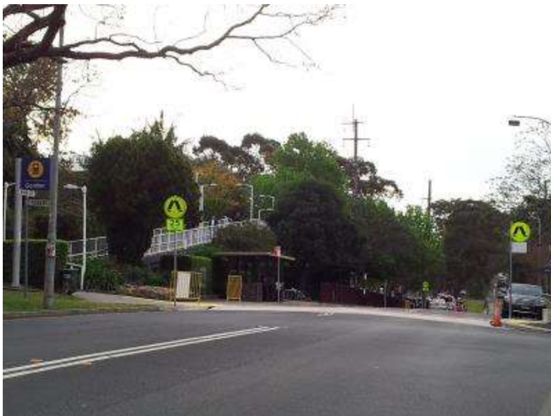
Upgrade of the pedestrian crossing near the intersection of Werona Avenue and Robert Street.