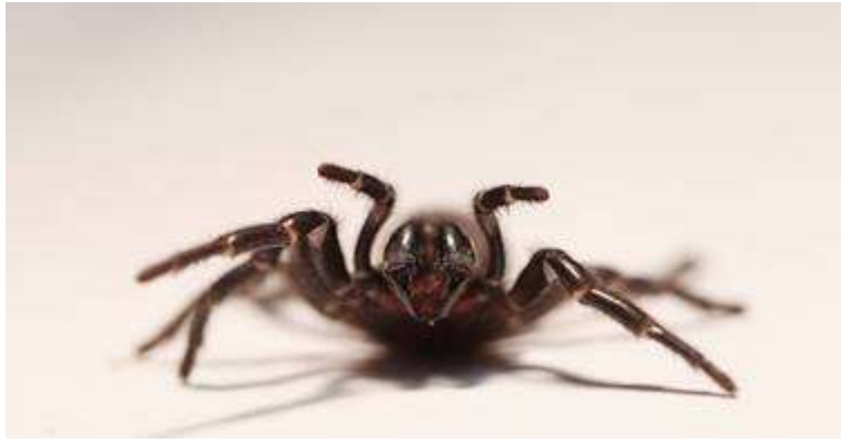
Beware the Sydney funnel web ( Atrax robustus ).

01 October , Photo(s) from the scene at Mona Vale. NSW police have confirmed at this stage that there are at least 2 people deceased and multiple persons injured. 4 rescue helicopters on scene and triage areas are been set up at Mona Vale and Royal North Shore hospital.